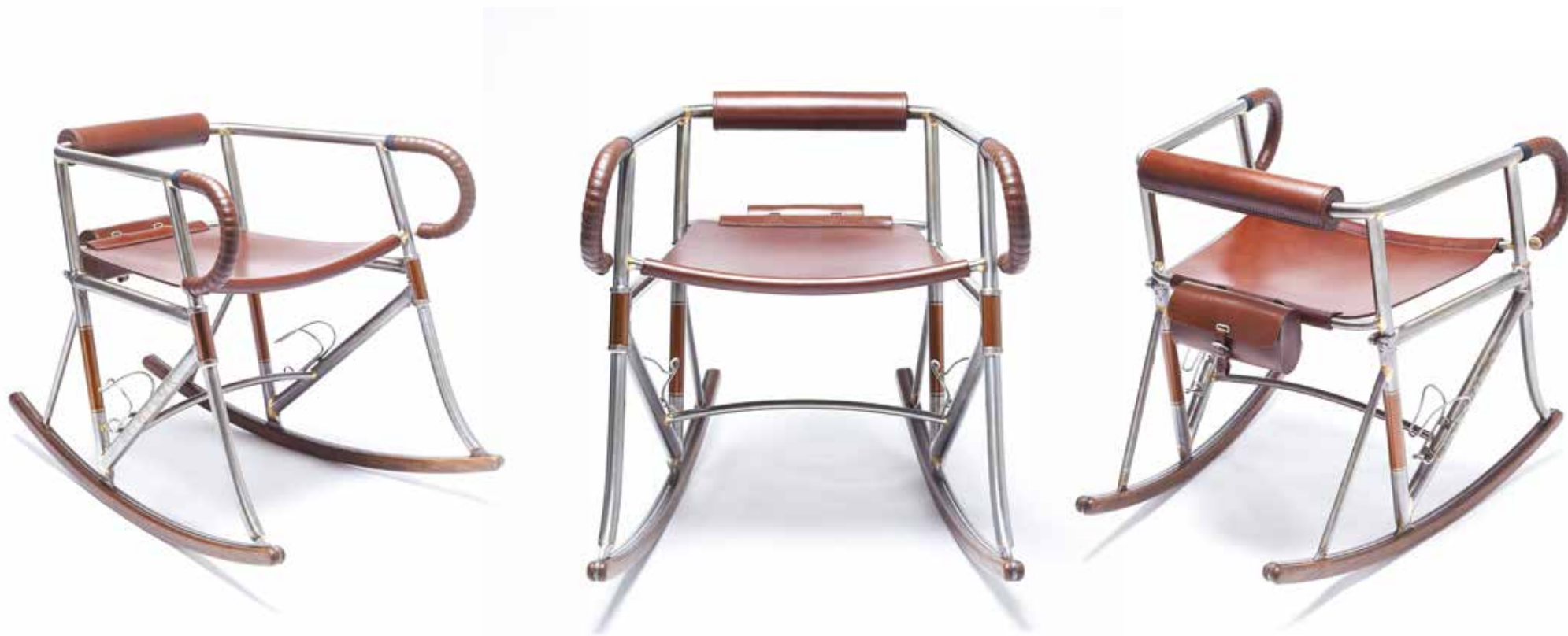
The Randonneur Chair